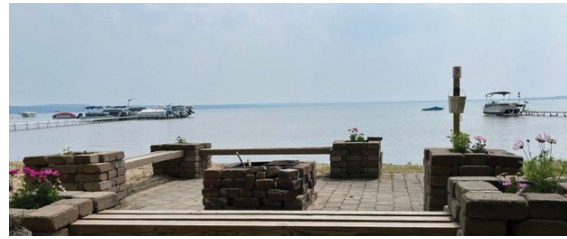
Shared Fire pit area with complimentary firewood provided

The Lodge and Cabins are located close to world class golf courses, ATV/ORV trails, river streams for canoeing and fly-fishing, cross-country skiing, State Parks and endless government hunting lands. Conveniently located are numerous tourist communities and attractions.