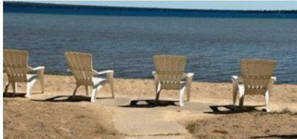
Beach and playground

The Lodge and Cabins are located directly on Higgins Lake with over 275 feet of private beach frontage for our guests. Spend endless hours making castles in the luscious sand, resting in the sunlight or enjoying the blue Caribbean waters and activities.